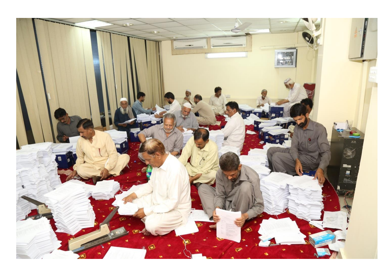
FBR officials photographed while making bundles of the copies of budget documents on 26th May 2017.