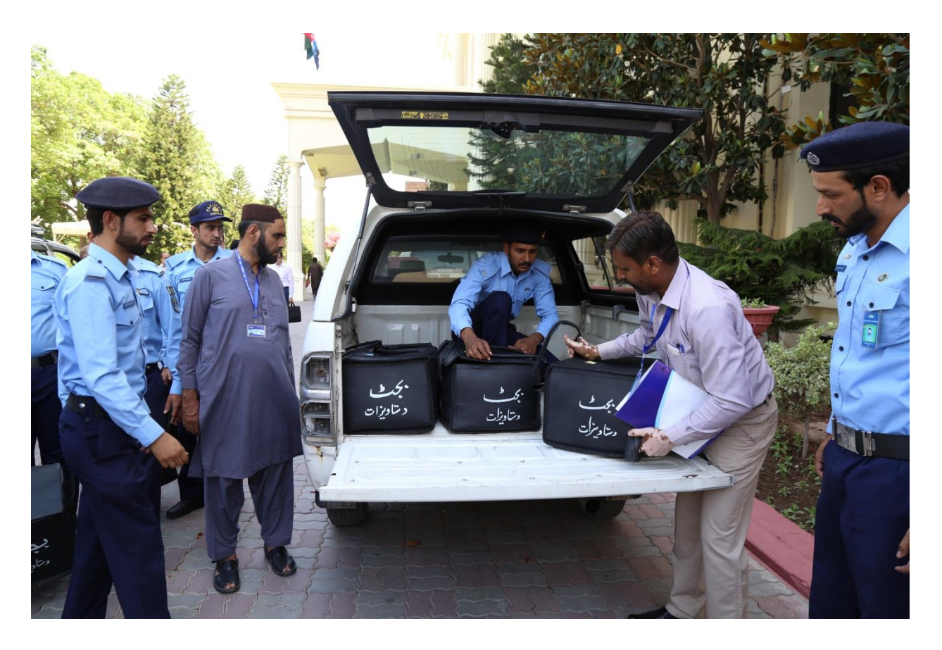
FBR officials loading budget documents on a vehicle for dispatching them to the Cabinet and National Assembly on the budget day.