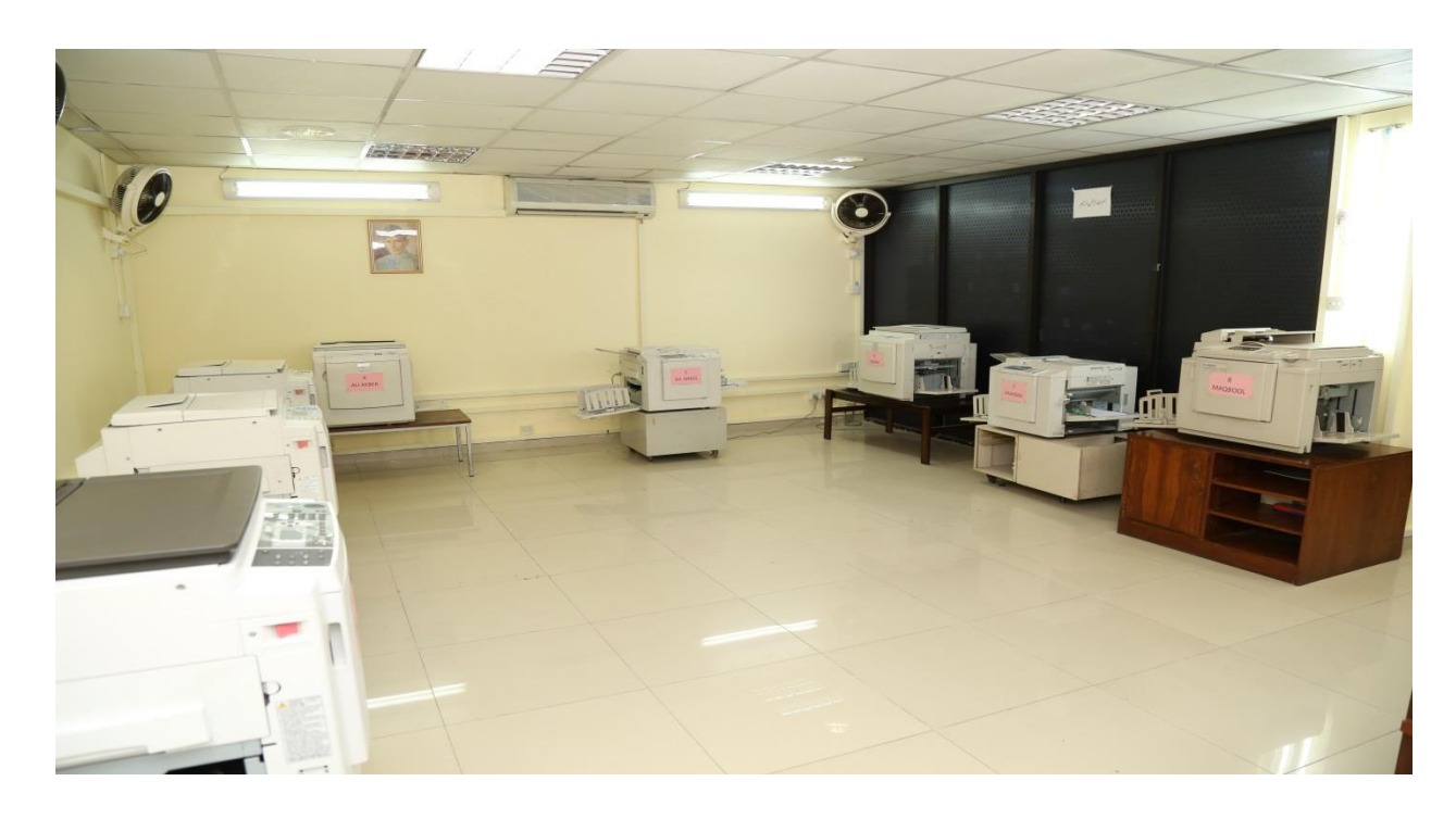
An inside view of the Printing Room.