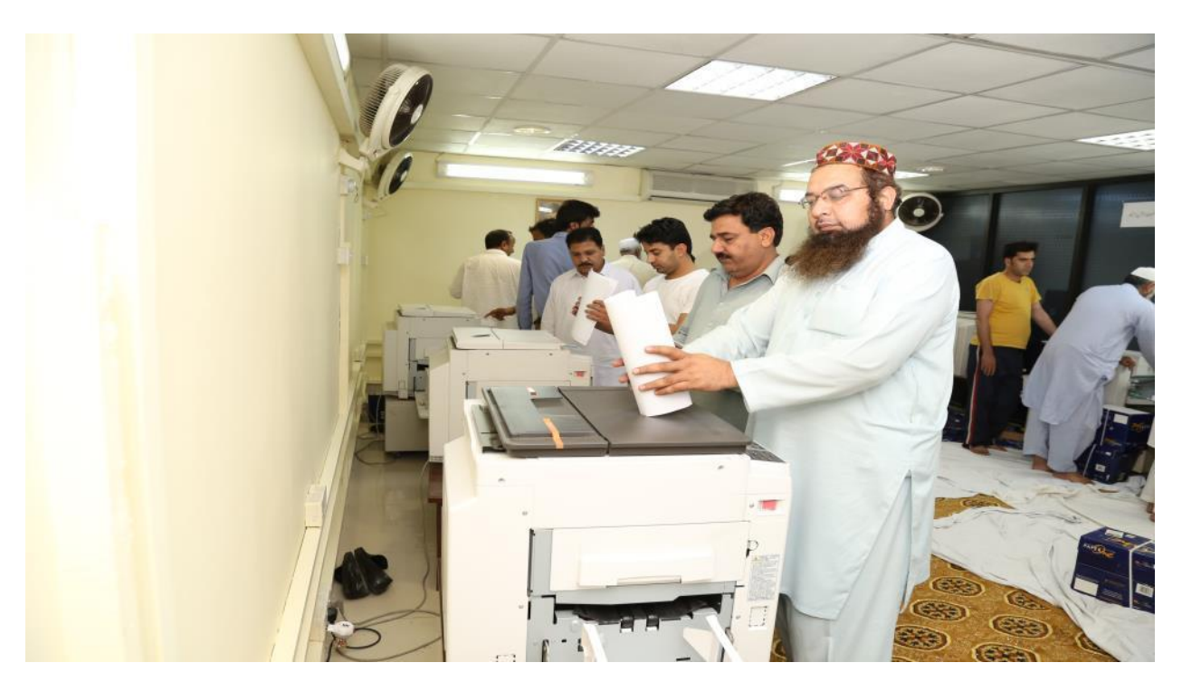
FBR officials busy in printing and making copies of budget documents ahead of presentation of the Budget speech on 26th May 2017.