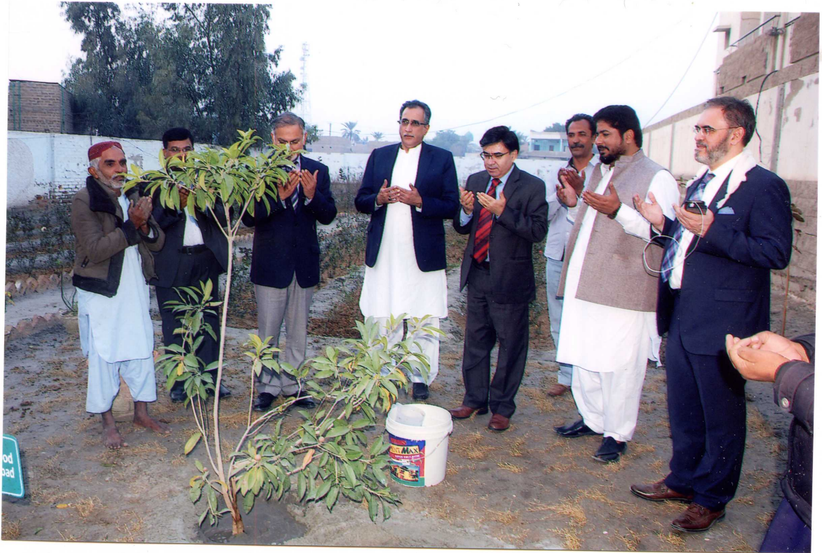
Member (Legal) planting a sapling at Inland Revenue Officers Colony, RTO Sukkur